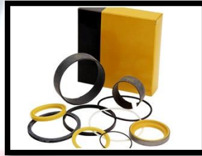
Custom Seal Kits