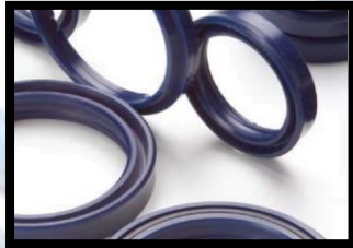
Fluid Power Seals